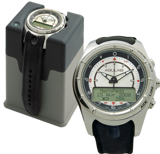
Figure 1 - The watch-dictaphone and its cradle

The PC software architecture was designed around a GUI from which the functional modules are called: the authentication module (for PC and watch users), the control speech module (based on