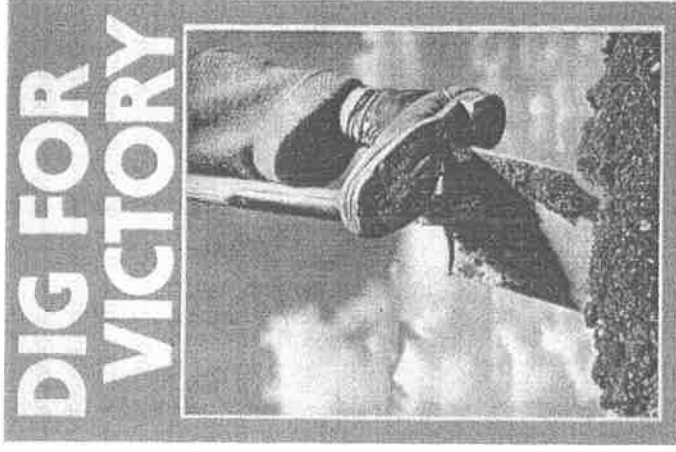
Figure 1.1 British "Dig for Victory" propaganda poster.

The recognition that she gets from the soldiers and the villagers comes not simply from being hard working, but because that hard work is perceived within the context of the community at war. The hard work is understood not