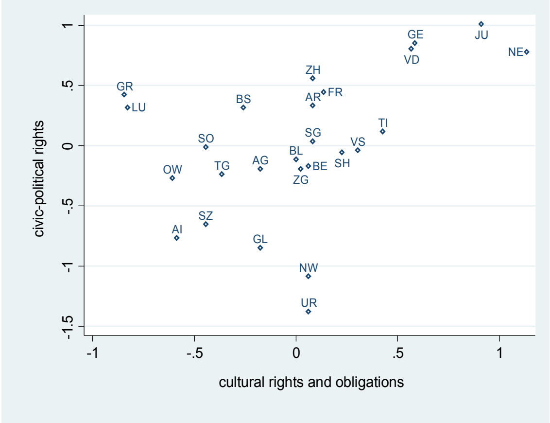
Figure 2 – Two-dimensional map of citizenship rights and obligations

Note: Entries are z-standardised values.