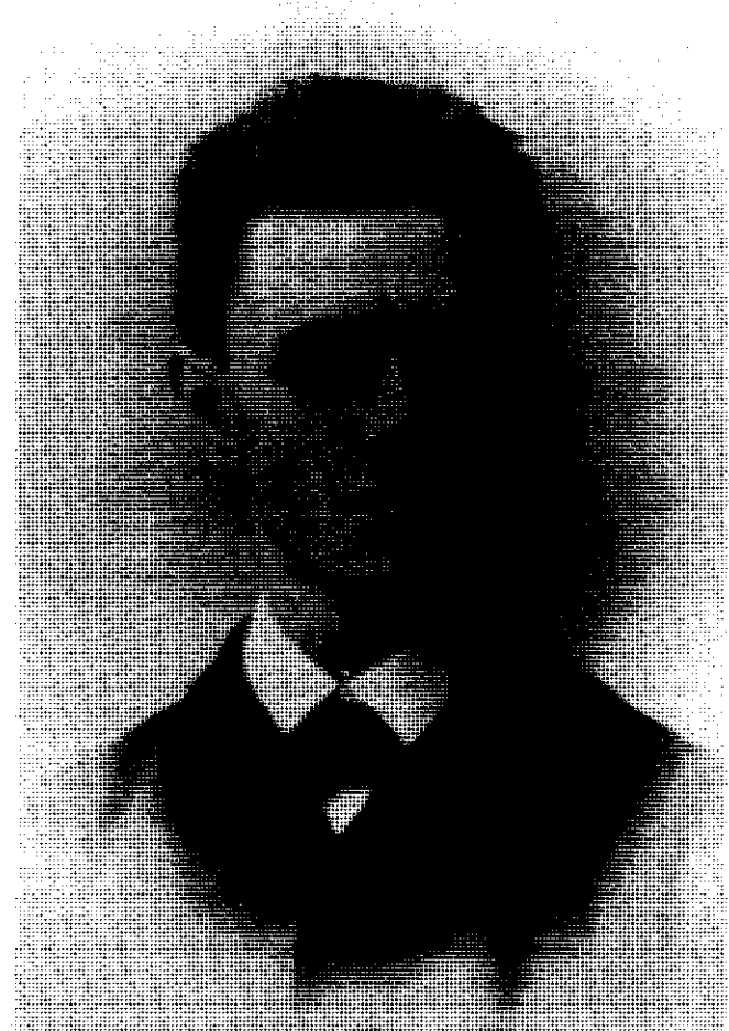
Otto JESPERSEN (1887)