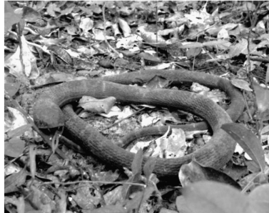
(d) Black Mamba