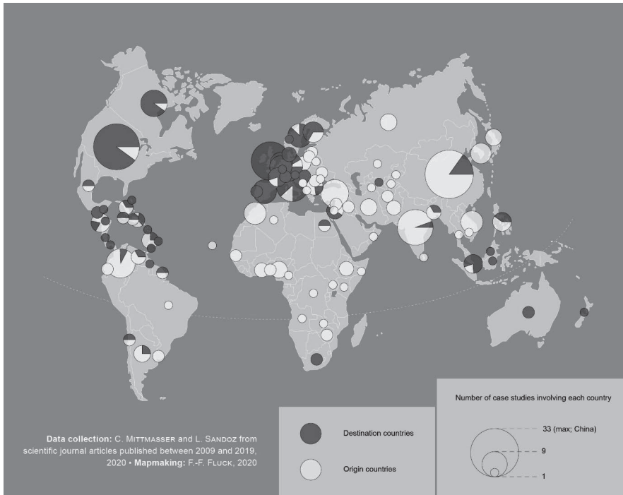
Figure 2: Origin and destination countries of migrants in transnational migrant entrepreneurship studies published in scientific journals between 2009 and 2019, n=155

spaces remain scarce. In order to gain a better understanding of the spatialities of transnational migrant entrepreneurship, we propose applying a mobility lens (Cresswell, 2010; Sheller & Urry, 2006) to seriously study if, when, where, and how transnational migrant entrepreneurs move, and across which borders. This involves paying specific attention to the multi-scalar movements of transnational migrant entrepreneurs (e. g. home, neighbourhood, city, region, international), the different material means used to move (e. g. telephone, computer, streets, cars, trains, boats, planes), and the diversity of mobility patterns embodied (e. g. linear, circular, cyclical, pendular, onward, repeated returns). Moreover, in our technologically connected world, transnational business activities increasingly involve moving goods, ideas, and capital via digital means, which reduces the need for the spatial mobility of entrepreneurs (Harima & Baron, 2020). Focusing on the complexity of mobility and immobility patterns involved in transnational migrant entrepreneurship would not only deepen our understanding of how entrepreneurs create transnational spaces but also challenge static and ethnic biases in the field.