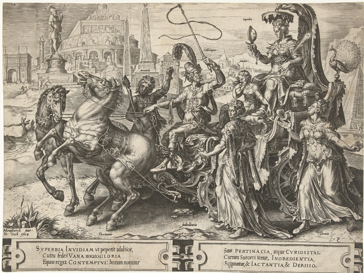
Cornelis Cort after Maarten van Heemskerck, published by Hieronymus Cock in Antwerp, The Triumph of Pride (Nr. 3 in the series: The cycle of vicissitudes of human affairs), 1564. Engraving, Rijksmuseum Amsterdam, inv. no. RP-P-1911-434.