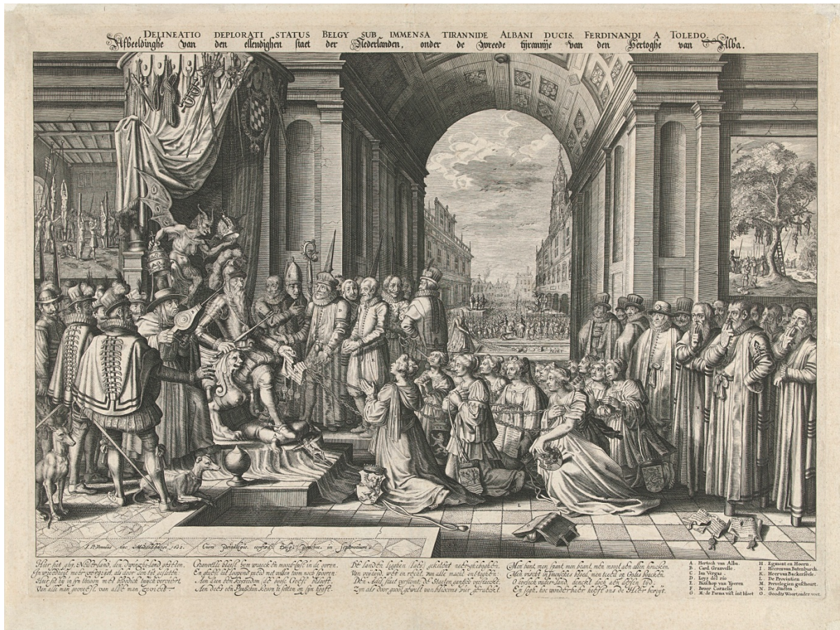
Willem Delff, published by Jan Pietersz. van de Venne in Middelburg, The throne of Alva, 1622. Engraving, Rijksmuseum Amsterdam, inv. no. RP-P-OB-79.001.