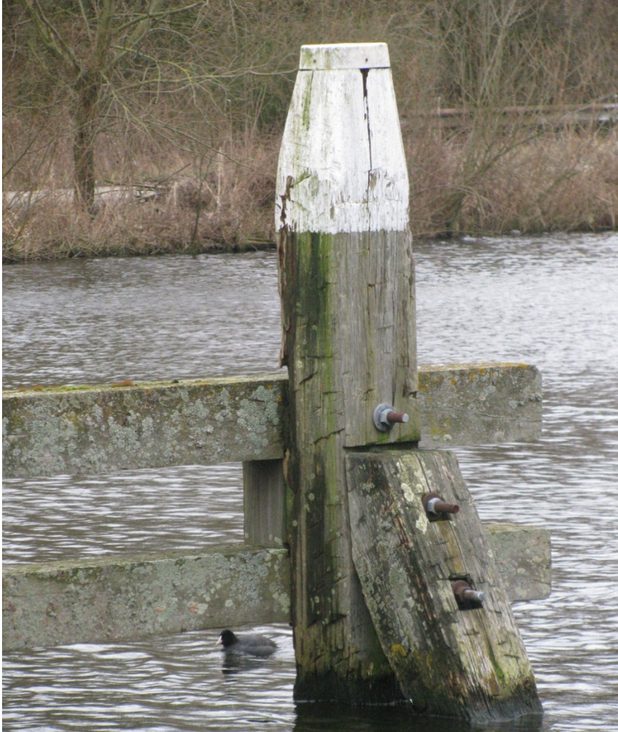
‘Dukdalf’, photograph by the author, Amsterdam 2013.