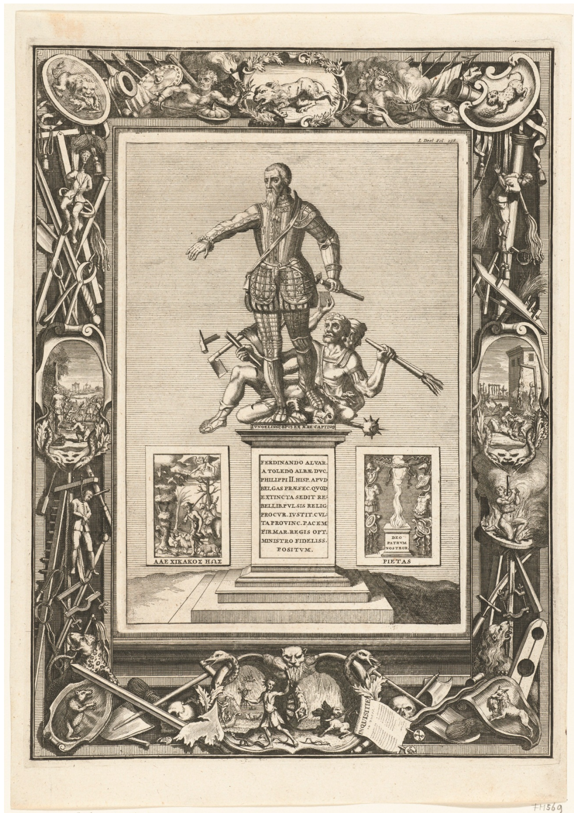
Anonymous copy after Philips Galle's engraving of Jacques Jonghelinck's sculpture, Monument to the duke of Alva of 1571, 1725. Etching, Rijksmuseum Amsterdam, inv. no. RP-P-OB-79.154.