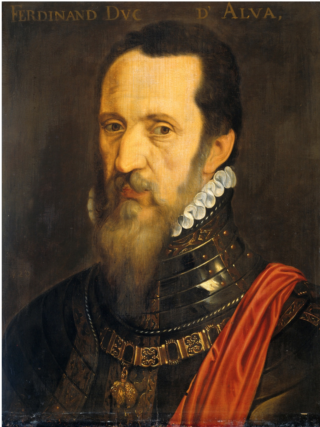
Willem Key (copy), Portrait of Fernando Álvarez de Toledo, duke of Alba, c. 1620. Oil on panel. Rijksmuseum Amsterdam, inv. no. SK-A-18.