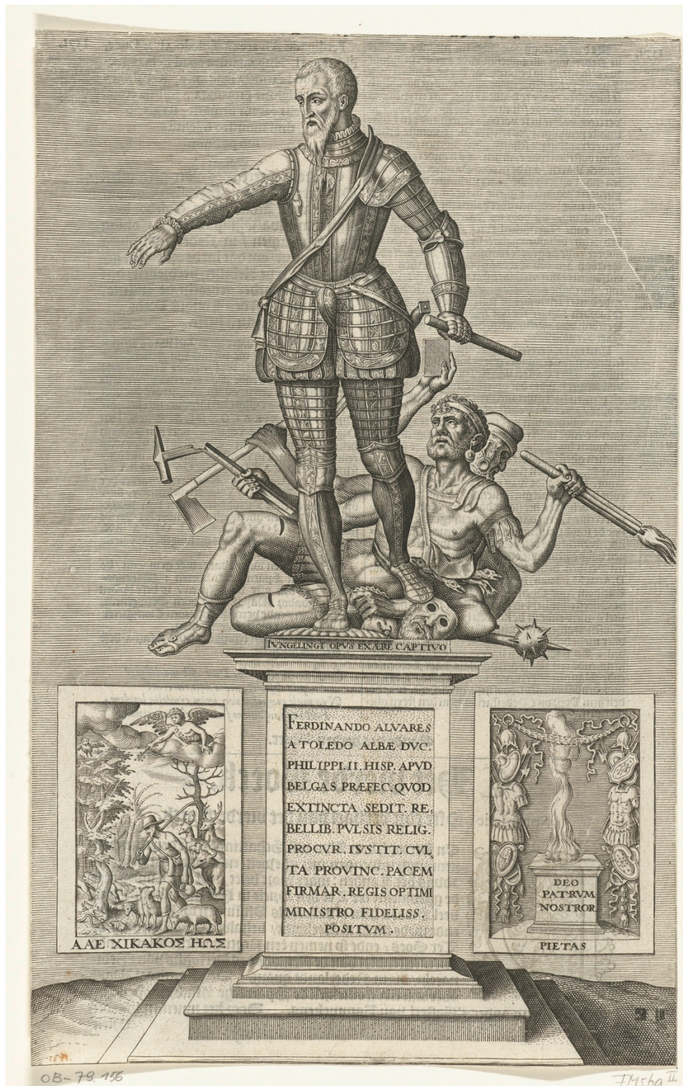
Anonymous copy after Philips Galle's engraving of Jacques Jonghelinck's sculpture, Monument to the duke of Alva of 1571, c. 1650. Engraving, Rijksmuseum Amsterdam, inv. no. RP-P-OB-79.156.