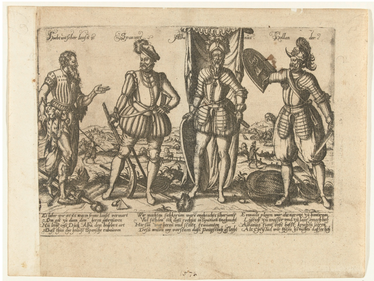
Anonymous (Germany), The complaint of the German and the Dutchman, 1567. Etching, Rijksmuseum Amsterdam, inv. no. RP-P-OB-79.022.