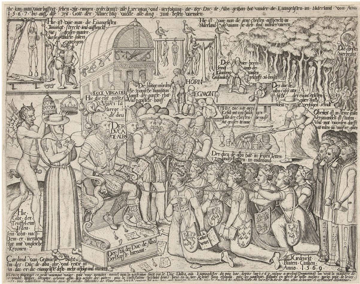
Anonymous (Germany or the Netherlands), The throne of Alva, 1569. Engraving, Rijksmuseum Amsterdam, inv. no. RP-P-OB-79.002.