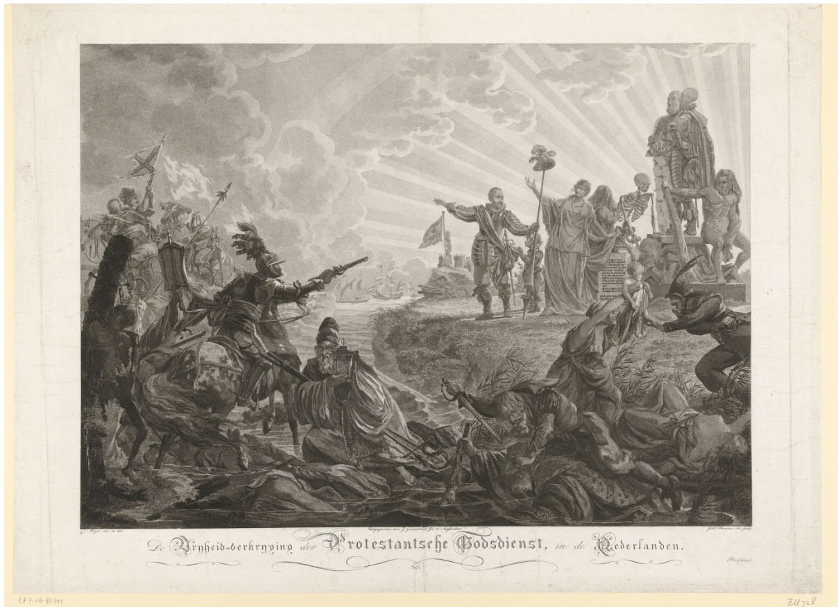
Joannes Bemme after C. Meyer, Celebration of the freedom of Protestant religion in the Netherlands, c. 1827. Stipple etching, Rijksmuseum Amsterdam, inv. no. RP-P-OB-80.441.