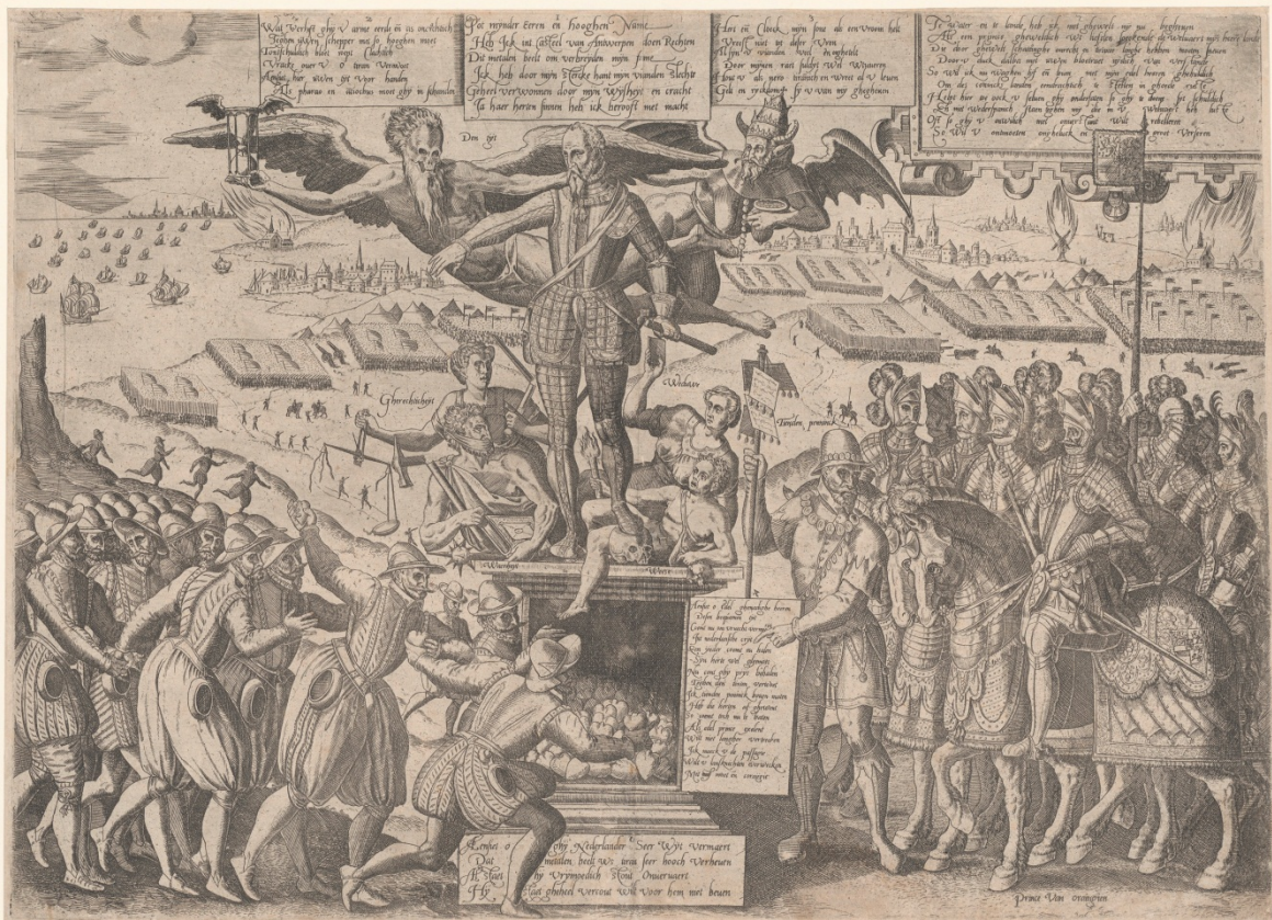
Anonymous (Netherlands), Satire on the duke of Alva's statue, c. 1572. Etching, Rijksmuseum Amsterdam, inv. no. RP-P-OB-79.166.