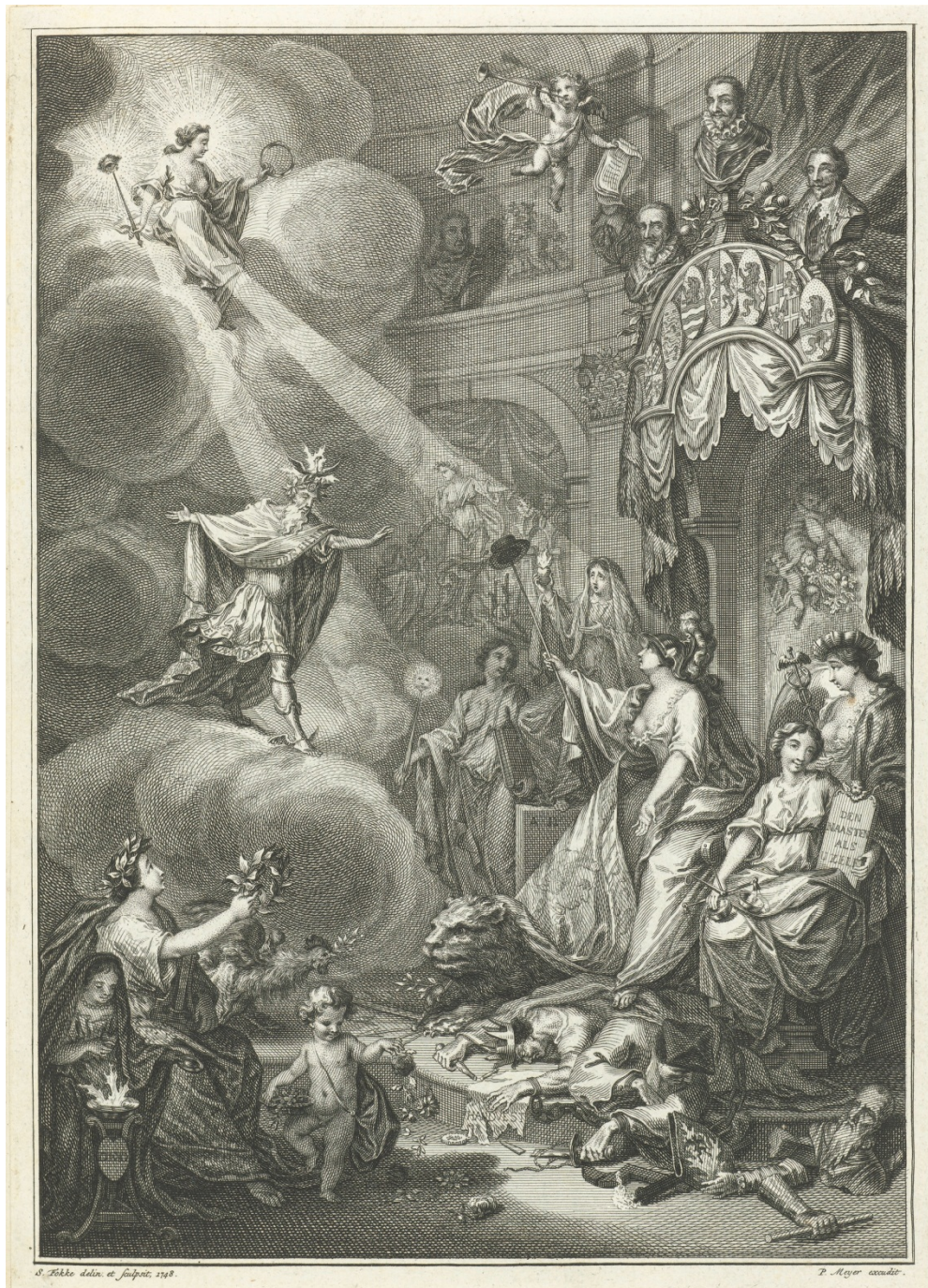
Simon Fokke, Centennial of the 1648 Peace treaty of Münster, 1748. Etching and engraving, Rijksmuseum Amsterdam, inv. no. RP-P-OB-84.046.