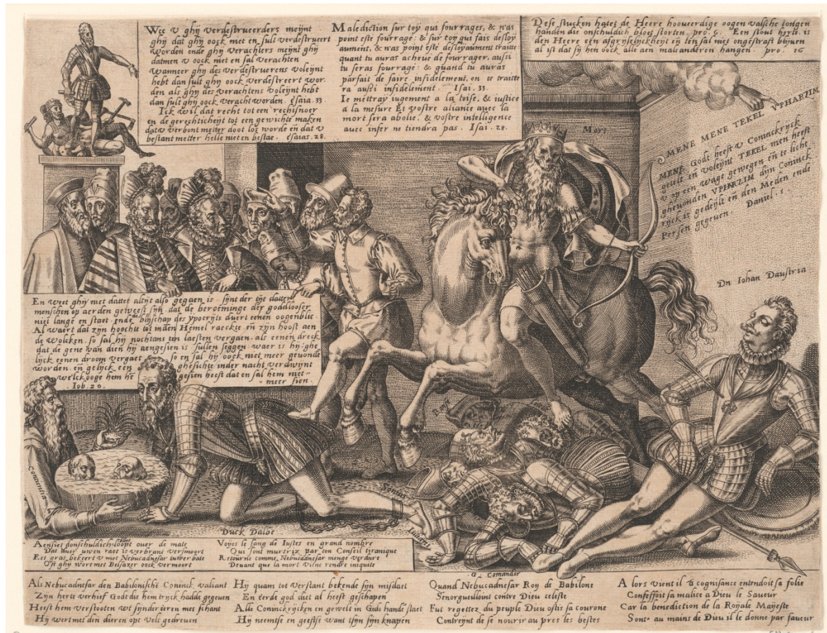
Anonymous (Netherlands), The death of Don John of Austria and the humiliation of Alva, 1578. Engraving, Rijksmuseum Amsterdam, inv. no. RP-P-OB-79.397.