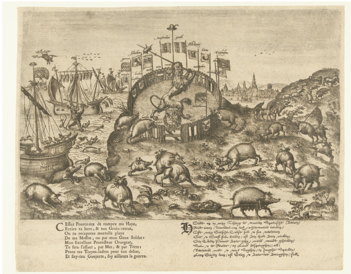
Anonymous (Netherlands), Stop rooting in my garden Spanish pigs!, c. 1580. Etching and letterpress, Rijksmuseum Amsterdam, inv. no. RP-P-OB-77.682.