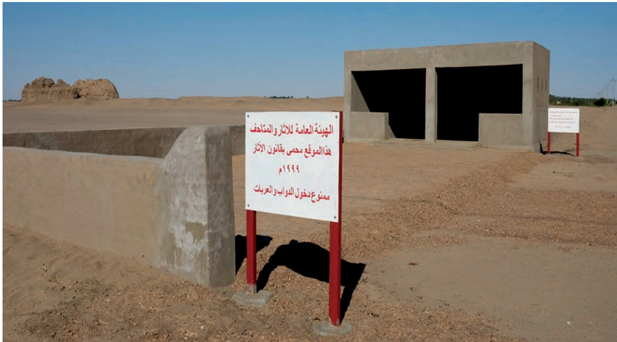
Figure 14/Visitors' Pavilion set up at the southern end of the Eastern Cemetery, where visitors arrive and park their vehicles.

Figure 15/Works in progress in the central hall of the Kerma Museum, where the 7 statues of the Black Pharos, discovered at Dokki Gel in 2003, are exhibited.