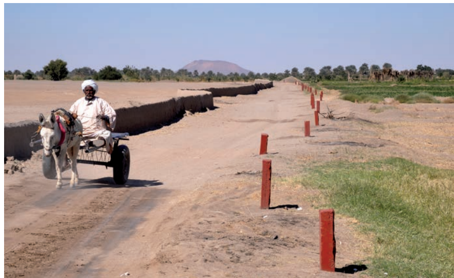
Figure 13/ Cement pillars marking the edges of the fields around the Eastern Cemetery.

During the 2016-2017 season, under the supervision of Marc Bundi, 15 workers finished the works protecting the Eastern Cemetery (figure 12). They cleared sand and vegetation from some parts of the site, rebuilt some sections of the surrounding wall, which is 5 km long, covered with earth (liaza) other sections, and manufactured 500 cement pillars 120 cm long, to be set up along the edges of agricultural fields in order to prevent their extension (figure 13). This additional protection was essential to avoid the encroachment of agricultural land, with its irrigation which is not always well controlled, rendering the periphery road impracticable and undermining the protective wall. The protective system is now in place, although the southern wall will need to be covered in earth (liaza) next year.