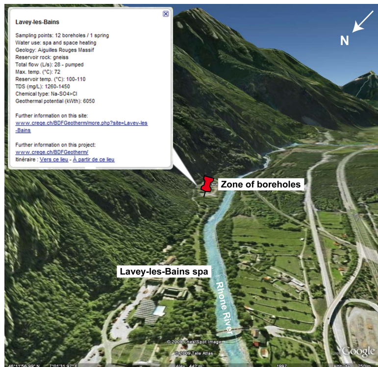
Figure 3: Example of Lavey-les-Bains geothermal site implemented in the Google Earth free software. Visualization of general information about this site is possible while clicking only once on the red pinpoint. Two Internet links allow returning to the homepage of BDFGeotherm in the CREGE website.