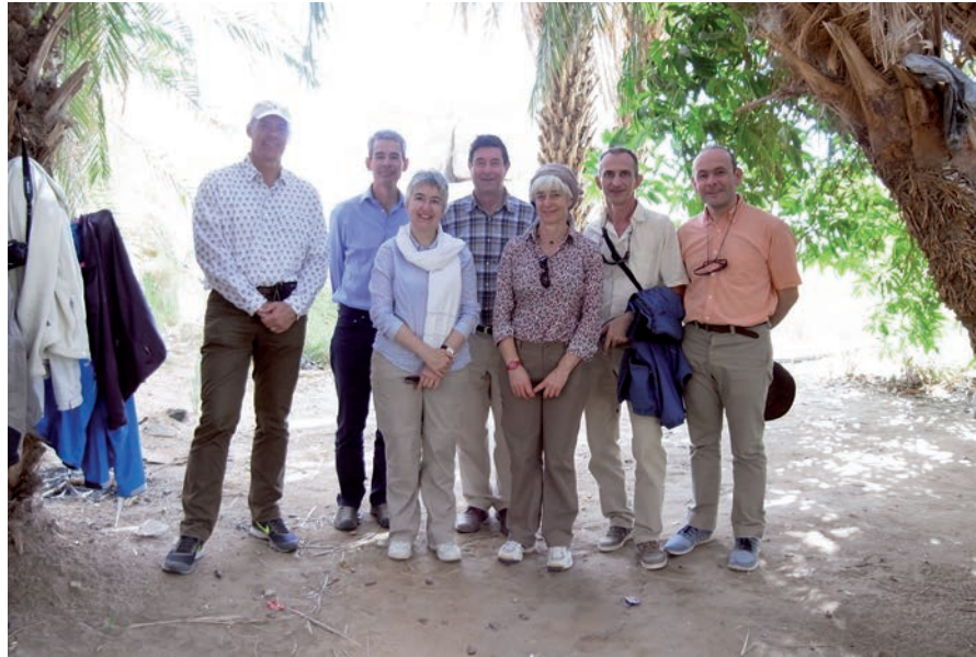
Figure 1 / Swiss delegation to Kerma in January 2016.