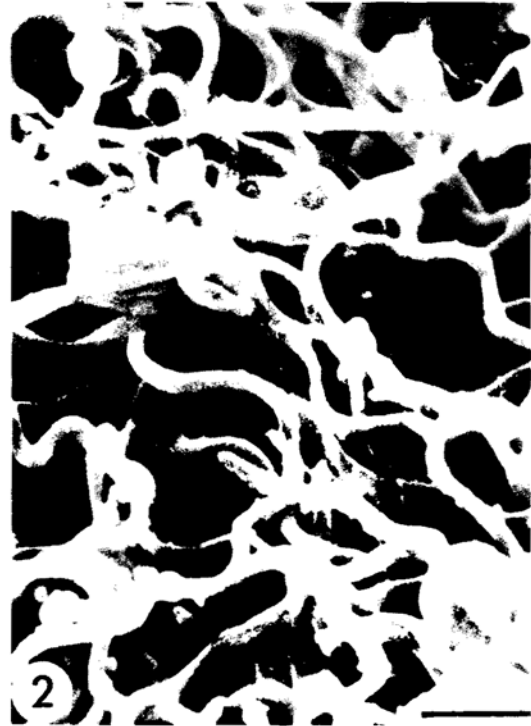
Fig. 2. Scanning electron micrograph of I. ricinus spirochetes in BSK medium (bar = 1.0 \mu m).

western blot analysis (Towbin et al., 1979). This procedure involves the separation of proteins in spirocheteal lysates by sodium dodecyl-sulfate polyacrylamide gel electrophoresis (SDS-PAGE), the electrophoretic transfer of proteins to nitrocellulose, the incubation of blots with antisera, and the detection of reactions with ^{125} I-labeled protein A by autoradiography. For details see Barbour et al. (1982a).