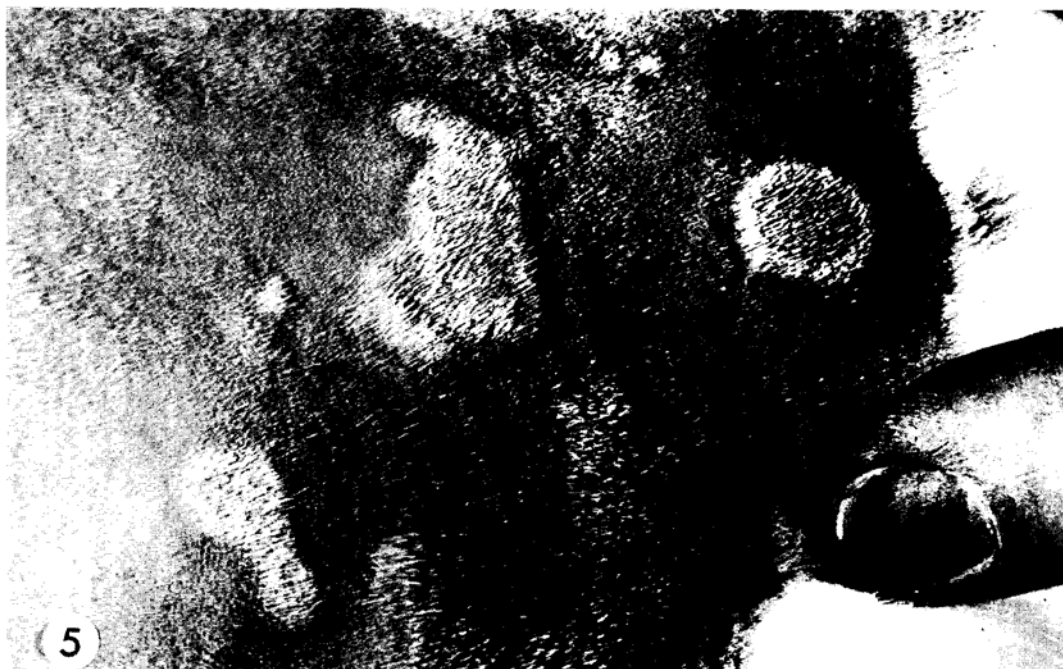
Fig. 5. ECM-like lesions on the trunk of a rabbit fed on by infected I. ricinus 12 weeks previously.

> 1:1,280 and 1:80 respectively against the I. ricinus spirochete whereas sera of 2 persons who had never experienced this illness were nonreactive.