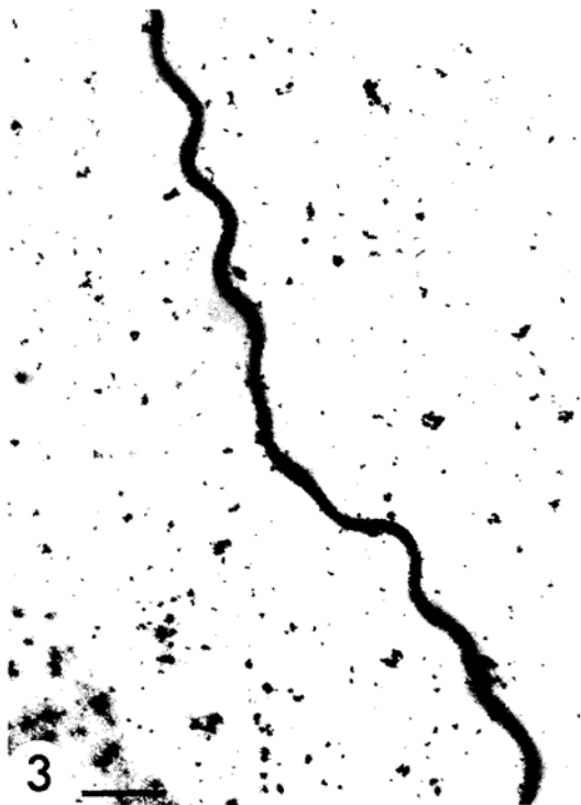
Fig. 3. I. ricinus spirochete negatively stained with 2% ammonium molybdate (bar = 2.0 \mu m).