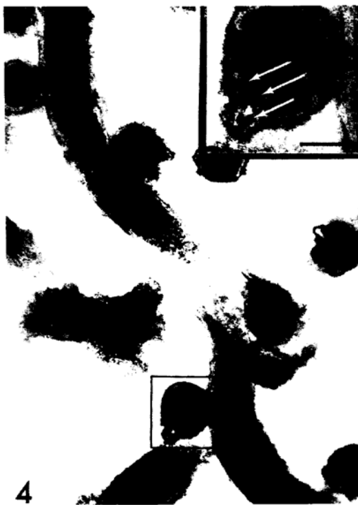
Fig. 4. Electron micrograph of the I. ricinus spirochete. Inset shows cross section with arrows pointing to 6 filaments (bar = 0.2 \mu m; inset bar = 0.1 \mu m).