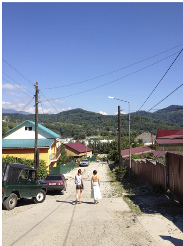
Figure 2. Locals walking in Kazachiy Brod in 2013. New houses, new fences, new streetlights.

Krasnaya Polyana. Every spectator and athlete will pass these villages repeatedly during the Games; aside from helicopter, there is no other way to travel between the Olympic Clusters. Figure 1 shows the location of Kazachiy Brod and Akhshtyr' in relation to Adler, Sochi, and the rest of Europe. Figure 2 shows a snapshot of Kazachiy Brod in 2013. Every house visible in the picture was built after 2007. Figure 3 shows houses in Akhshtyr' surrounded by new power towers, along the construction road that leads through the village to the new quarry.