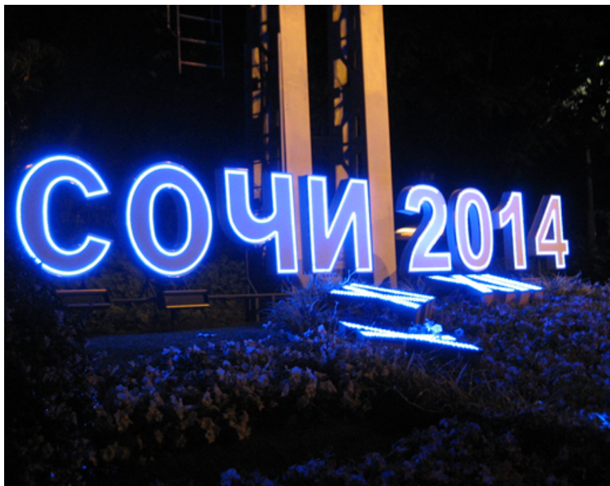
The Olympic clock is ticking... neon installation when entering Sochi, August 2009.

Online Journal of the Center for Governance and Culture in Europe University of St. Gallen URL: www.gce.unisg.ch , www.euxeinos.ch ISSN 2296-0708