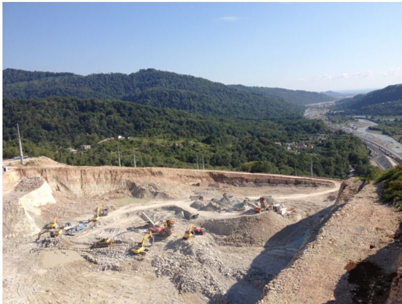
Figure 5. New quarry, set against the backdrop of the houses of Akhshtyr', 2013.

lage (see Figure 5). The presence of the quarry is highly disturbing to residents. The drilling noise is ceaseless and can even be heard across the river in Kazachiy Brod, but in Akhshtyr' it is oppressive and inescapable. Work continues at night by the light of powerful spotlights. This activity creates a constant cloud of pulverized rock dust which is a daily disturbance to villagers. Finally, and perhaps most importantly, the quarry itself represents the illegal destruction of a staggering amount of protected wilderness in a national park. Complaints