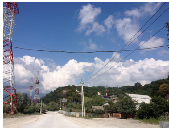
Figure 3. Houses on the construction road to Akhshtyr' in 2013. New power lines and towers.

(Author interview: Kazachiy Brod resident "A", August 25, 2013.)