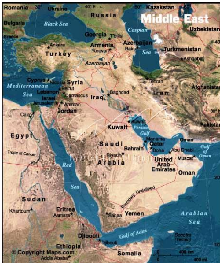
Iraq and its neighbours

economic problems, the sudden, repeated arrival of refugees is likely to constitute a burden rather than an asset.