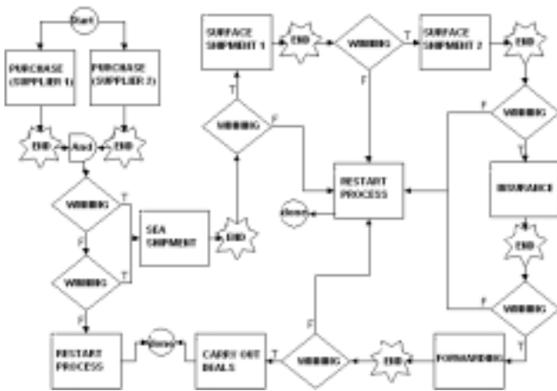
Figure 1. “Importing package” Wf model in WLPI

In our example, the buying company has to take a decision regarding the number of negotiations that should be launched for the purchase of the goods. These tasks could be initiated at the same time, but only one deal should be struck. The next step will be to start negotiations for the shipment services. We choose to begin by negotiating the sea shipment, and then the two surface shipments (from warehouse of origin to port of shipment, and from port of destination to warehouse of destination). The reason why the sea shipment is negotiated first is that surface transportation is usually more flexible and available. It will hence be easier to schedule the truck arrival (resp. departure) time to port of shipment (resp. from port of destination) with respect to the vessel loading (resp. unloading) time (than to do it in the opposite way). The insurance and the forwarding negotiations are planned in sequence as the last two items of the model. (For the sequencing, see Figure 1.)