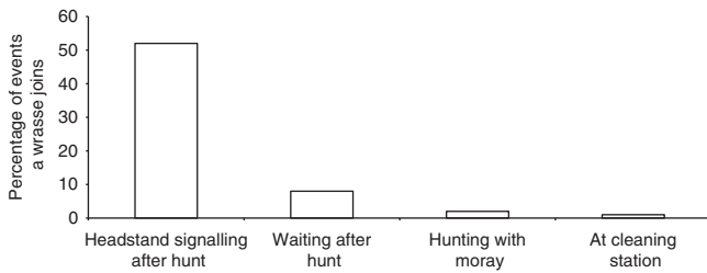
Figure 1 | Attraction of wrasses to the headstand gesture. The percentage of events in which a wrasse comes within 10 m of the grouper within 5 min of the grouper beginning to: headstand signal after an unsuccessful hunt ( n=23 ), wait without signalling after an unsuccessful hunt ( n=74 ), hunt with a moray ( n=82 ), be attended to at a cleaning station ( n=100 ).

The grouper's signalling has hallmarks of intentionality. We provide evidence that the grouper's headstand signal exhibits three features used as key indicators of an intentional signal production: persistence until the goal is reached, elaboration of the communication if it does not initially achieve its goal, and means-ends disassociation by using two signals for the same goal 20–22 .