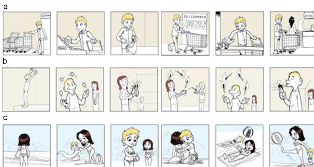
Figure 1. Examples of the sequences used in the storytelling tasks. (a) Complexity level 1 (low referential complexity); (b) Complexity level 2 (intermediate referential complexity); (c) Complexity level 3 (high referential complexity).

task (three stories for each level of complexity). The first and lowest complexity level (level 1) corresponds to sequences displaying one character (Figure 1A); the intermediate level (level 2), to sequences displaying two characters of different genders (Figure 1B); and the third and most complex level (level 3), to sequences displaying two characters of the same gender (Fig. 1C).