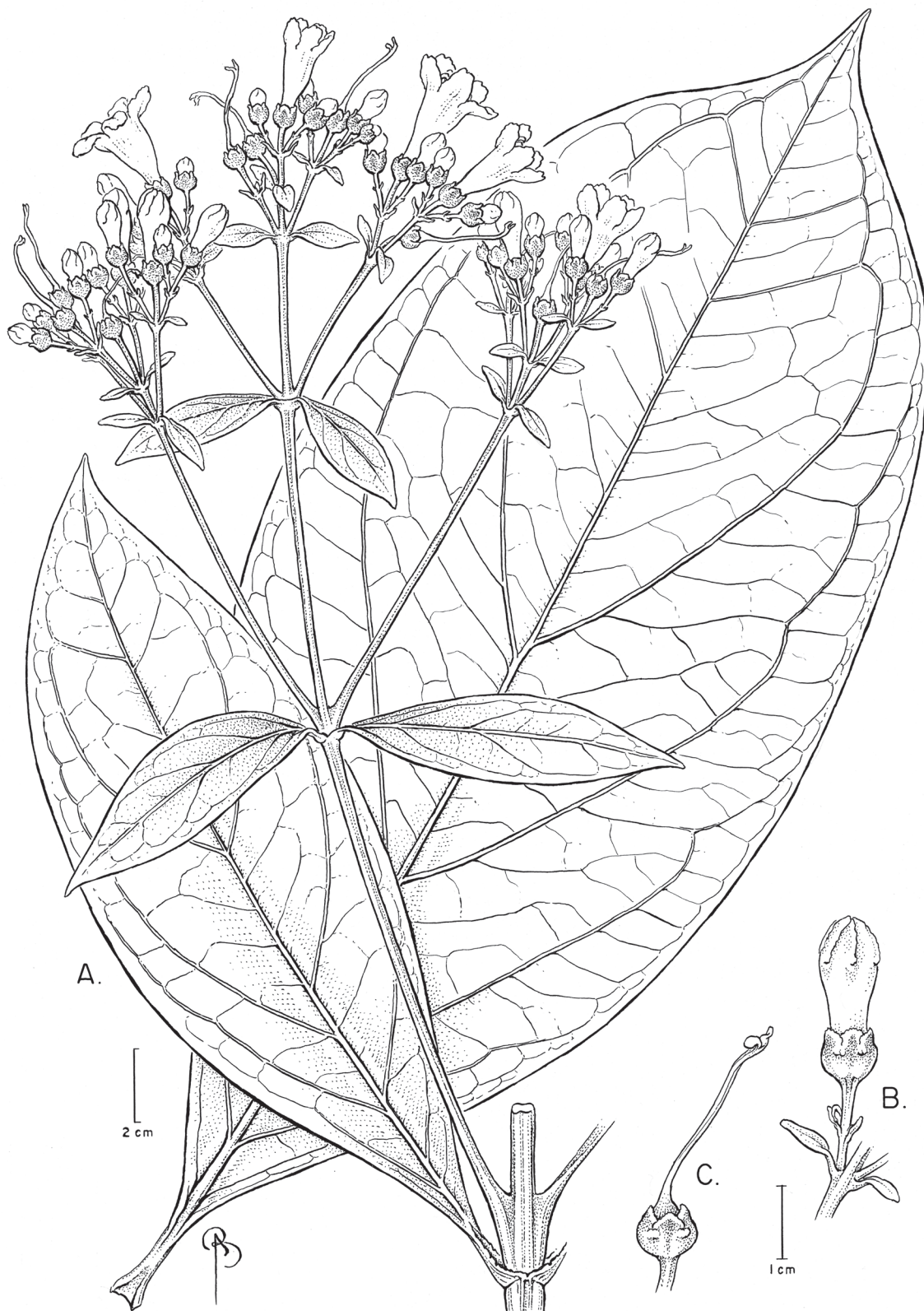
FIGURE 3. Macroparpaea huamantanga . A, lower leaf and habit of flowering stem; B, bud; C, pistil in calyx. All drawn from View & D. Desrousseaux 43 (NY).