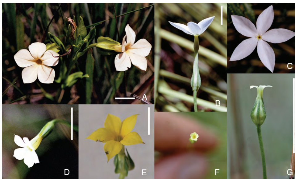
FIG. 1. Selected species of Exochaenium investigated in this study illustrating variation in flower morphology. (A) Exochaenium grande with large inclined distylous flowers. (B, C) Exochaenium teuszii with erect flowers and long, narrow corolla tubes associated with hawkmoth pollination. (D) Infundibuliform corolla tube of distylous E. exiguum . (E) Yellow, erect flower of homostylous E. clavatum . (F, G) Tiny, erect flowers of homostylous E. baumianum . Scale bars = 1 cm.

Exochaenium is endemic to sub-Saharan Africa, with species occurring in most tropical and sub-tropical regions of the continent, particularly on the Katanga plateau (Angola, Democratic Republic of Congo and Zambia), with many extending to the Sudano-Zambesian and Guineo-Congolian regions (Kissling, 2012). All species are erect, insect-pollinated annuals with populations occurring in a wide variety of habitats, including tropical forest ( E. oliganthum ), grasslands and savannas (most of the