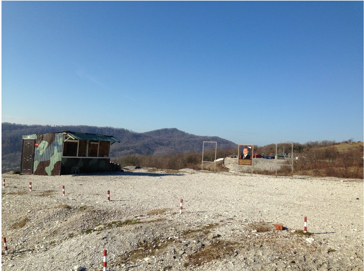
Figure 1: Accidentally stumbling onto a military firing range by a remote mountain village in Sochi. A picture of the Russian president overlooks piles of used ammunition.

Immediately I felt exposed and vulnerable. It was a sudden sense of not-belonging , and I wanted to run back the way we came. But it had been steep and filled with prickly bushes, so we hurried through the empty range and found the village road. But there was a military base sited there, green tents behind portable concrete walls. We ran into a group of soldiers leaning against them, guarding the entrance and looking bored. We gave our best nonchalant hellos as we passed, but a minute later two soldiers past us in a jeep, pulled to a stop in front of our path, and asked for our papers. We had no documents at hand, so we shared a surreal circular discussion: