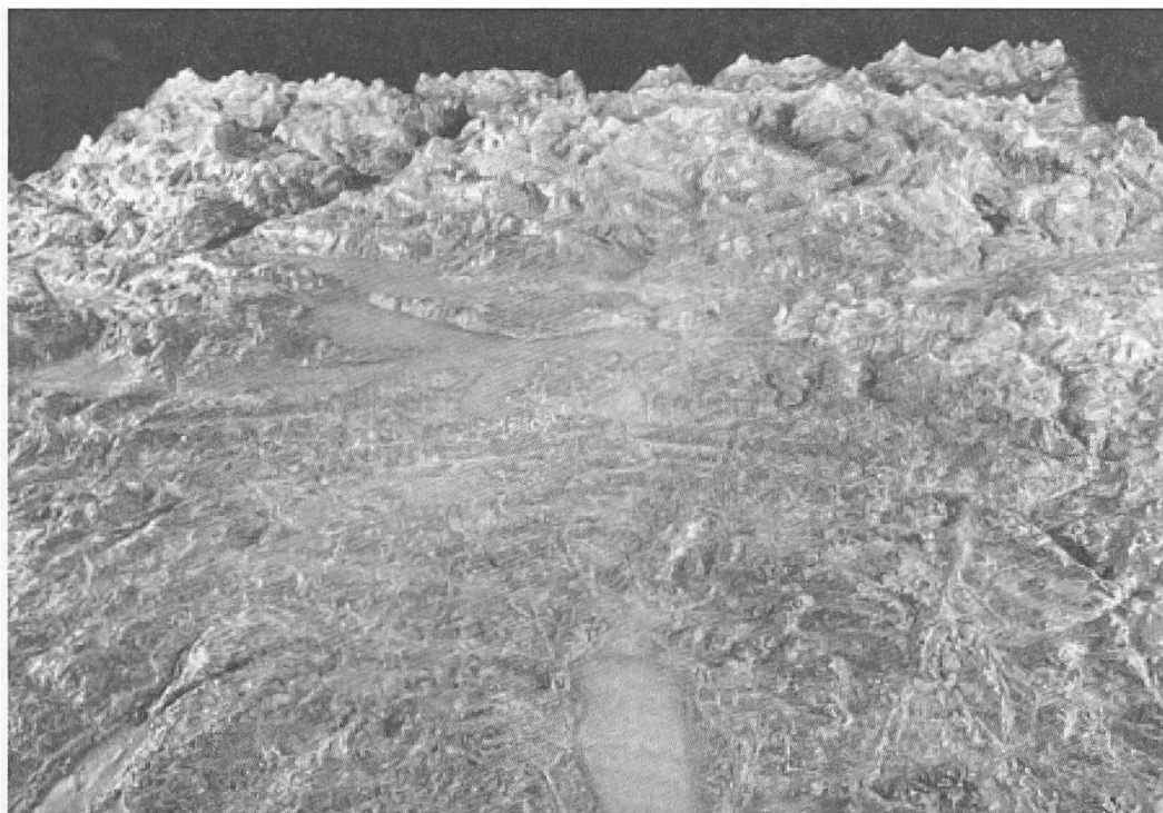
Figure 4: Relief-Map of Lake of Four Cantons, by Franz Ludwig Pfiffer von Wyher (1716–1802)

with the pleasure of domination.” 36 Wordsworth makes a similar observation, claiming that by overlooking the scenery from a “little platform,” which reproduces the effect both of Picturesque tourism and of prospect poetry, the spectator receives aesthetic pleasure, “exquisite delight to the imagination,” but also, and more importantly, utilitarian pleasure by apprehending all the landscape “at once.” 37