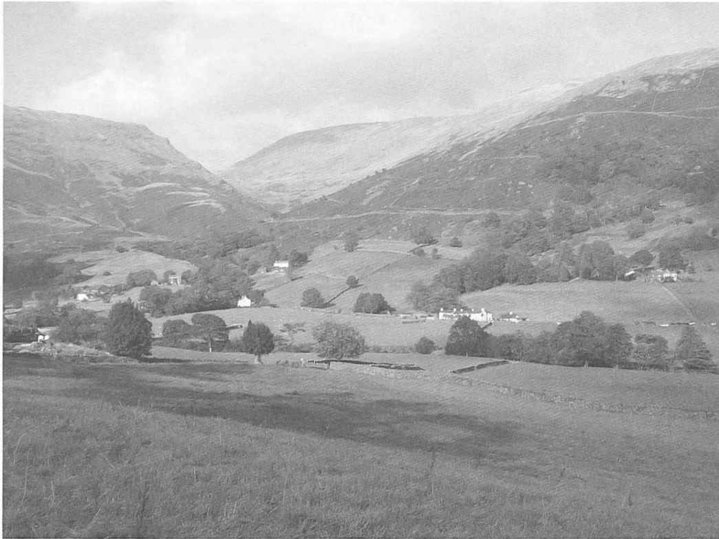
Figure 3: Estate Farms in Grasmere Valley

The word “prospect” points back to the prospect poem tradition, poetry that describes the surrounding physical world from a single perspective in order to symbolically confer authority on the landowner. As Tim Fulford has argued, “Home at Grasmere” usurps the power of the landowner, but also of the local inhabitants, in order to empower the poet himself. This authority is not based on actual ownership, but on the spiritual possession of place. 33 The passage reminds us, however, that the poem also usurps the authority of Switzerland’s landscape. No longer is it the shepherd, or even the huts who lord over and possess the vale: it is the poet-traveller who is given that prerogative thanks to his aesthetic training, described in his aesthetic fragment as a gradual opening of the mind from the perception of sublimity to that of beauty. 34 An appreciation of the Beautiful, for the later Wordsworth, reflects a viewer’s maturity.