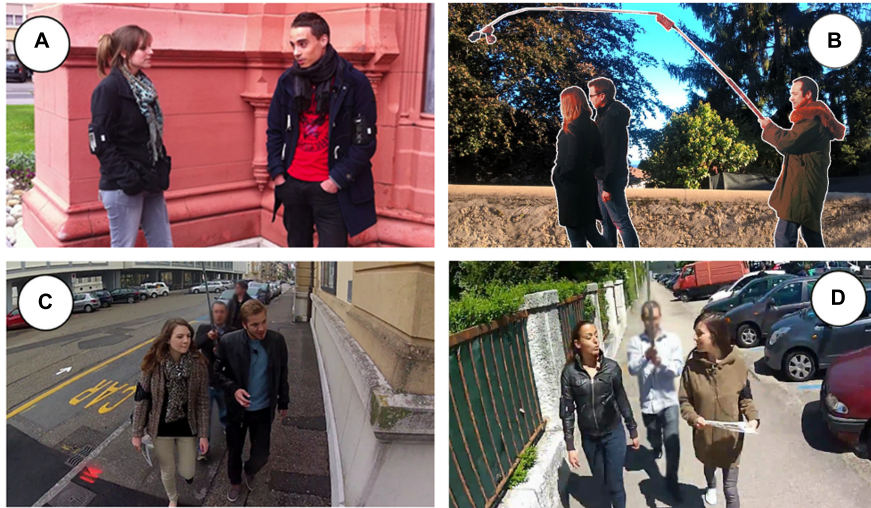
FIGURE 1 | (A) Talk-only condition. (B) Lateral view of the perch. (C) Talk-and-navigate condition, pair turning to their left. (D) Talk-and-navigate condition, pair engaged in mutual gaze.

printout) with the itinerary indicated in red. Both participants were instructed to follow the itinerary together. Navigators were further told they were responsible for the itinerary. Each participant was also equipped with an audio recorder and a tie microphone as a backup.