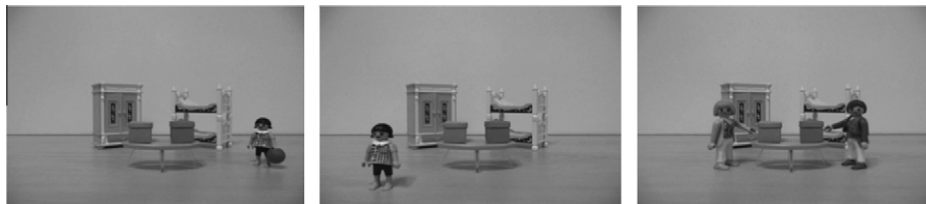
Fig. 1. Vignettes for the ball story: Camille arrives (first vignette); Camille leaves after having put the ball into one of the two boxes (second vignette); and two women point at the different boxes (third vignette).