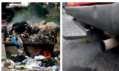
Figure 1. Photographs given by the teacher.

This pedagogical design was as explicit as possible concerning both the cognitive task to be addressed by the pupils (questions were written on the blackboard to guarantee clarity) and the social organization of the discussion (in dyads or in the whole class, depending on the stages). Moreover, it is also important to say that the two images proposed (Figure 1) were deliberately chosen in such a way that they could remind these young pupils of Kosovo, even though this country was