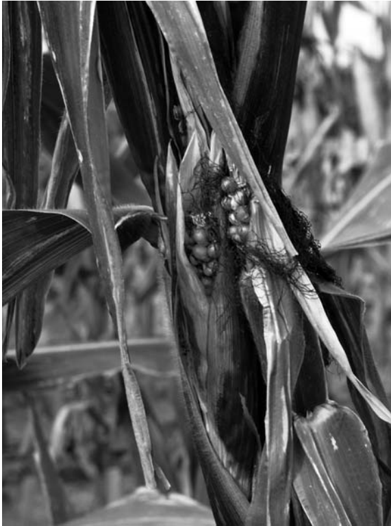
PLATE 1. Female ears of an F_1 hybrid between maize ( Zea mays L.) and “mexicana” teosinte ( Zea mays ssp. mexicana Iltis and Schrad).

maternal parent. However, we were unable to obtain sufficient numbers of hybrid seed because thorough emasculating of T was extremely difficult. Consequently, for most T-produced seeds, paternity was too uncertain to proceed with planting. This category was thus excluded from our study. Segregation of the hemizygous transgene in H is expected to give a Mendelian ratio of 1:1 transgenic (glyphosate tolerant):non-transgenic (glyphosate intolerant) independent of the direction of the cross.