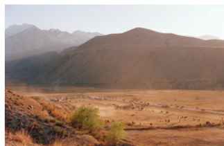
↑ At Chabysh Festival