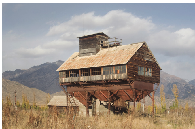
↑ Near Cholpon-Ata