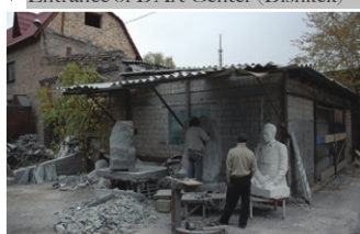
↑ Sculptures at B'Art Center (Bishkek)