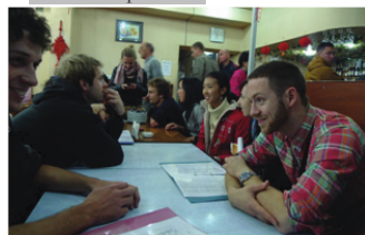
↑ First discussions