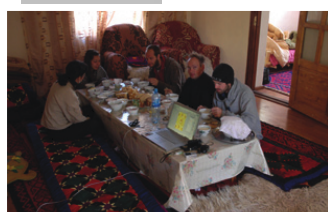
↑ Breakfast and designing of the poster