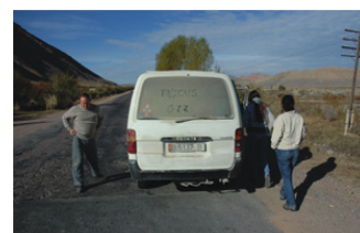
↑ Road trip with the participants