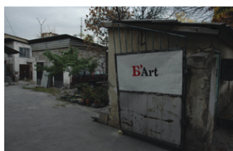
↑ Entrance of B'Art Center (Bishkek)