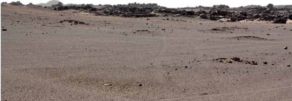
Figure 6 / Wadi Farjar, site FAR39 discovered by Osman and Edwards. This site is composed of fireplaces forming small mounds.

Only 53 of the 88 occupations could be dated. Compared with sites discovered in the Kerma region, we notice certain constancies, such as the fairly high frequency of Neolithic deposits assigned to the 5th millennium BC, of which ceramics with burnished surfaces and frequent comb decoration are characteristic (figure 7). In contrast, Wadi Farjar has revealed significantly more Pre-Kerma sites (figure 8) and particularly sites dated to the Kerma period. Having at hand an estimate of the number of sites per period allows us not only to ponder the density of past occupations, but also the representativeness of our finds. From this perspective, the comparison between the situation at Wadi Farjar and in the Kerma region is interesting (figure 9). On one hand, Wadi Farjar is mostly unaffected by recent human activities and should give us a relatively representative image of the past. On the other, the region of Kerma spreads over an immense alluvial plain, highly cultivated. Although a few large and archaeologically rich sites remain, the smaller