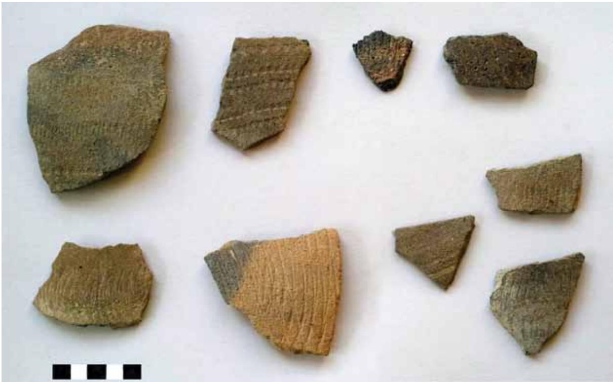
Figure 7 / Wadi Farjar, site FAR50. Pottery sherds dating from the 5th millennium BC.