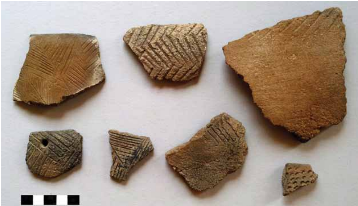
Figure 8 / Wadi Farjar, site FAR28. Pottery sherds dating from Pre-Kerma period (3500-2500 BC).