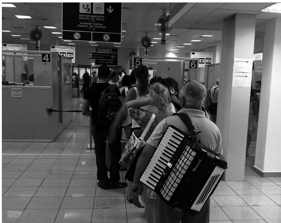
Fig. 2: The Schengen border in Larnaca, Cyprus Die Schengen-Grenze in Larnaka, Zypern La frontière de l'espace Schengen à Larnaca, Chypre

factors that contribute to migration, and the interactions between these factors. For this reason we have contributed to research on the history of immigration in Switzerland (PIGUET 2009a), the geographical distribution of asylum seekers in Europe (EFIONAYI-MÄDER 2005), the migration of football players (POLI 2004) and sex-workers (THIÉVENT 2010a, b), and the migration intentions of students in West Africa. We have also recently developed a new focus on the effects of global warming on migration. These issues are studied through the use of case studies (including Bolivia, Iran, Niger and Peru), as well as from a theoretical and epistemological perspective (PIGUET et al. 2011). The IGG's research on this topic will contribute to the IPCC's fifth report on the social consequences of climate change.