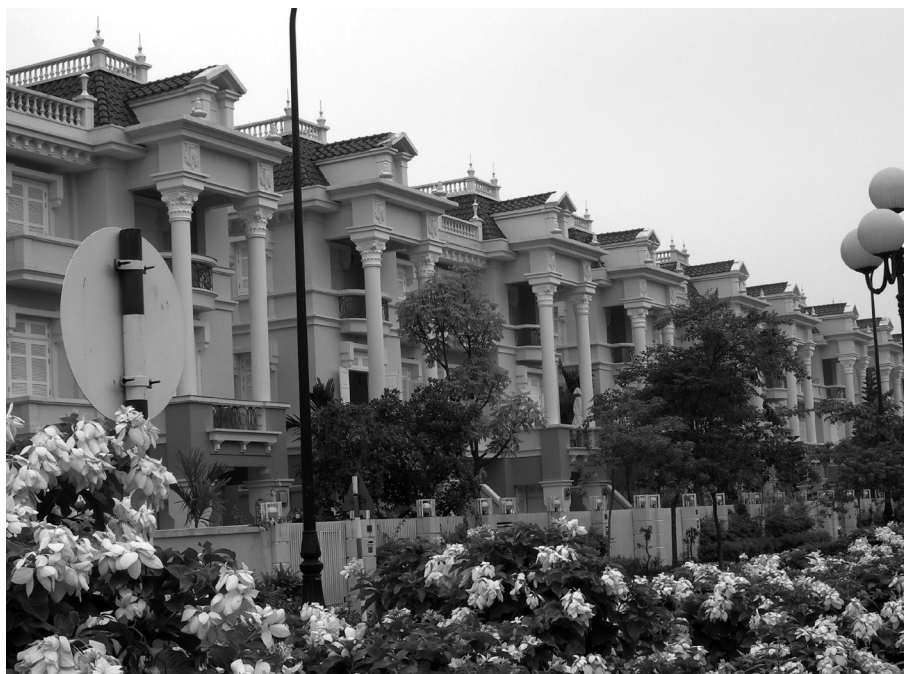
Fig. 3: The gated community as a recently introduced urban type in Hanoi, Vietnam Eine geschlossene Wohnanlage als kürzlich eingeführter städtischer Siedlungstyp in Hanoi, Vietnam La communauté fermée: un nouveau type d'habitat urbain à Hanoi, Vietnam Photo of Ciputra Hanoi International City by O. SÖDERSTRÖM

tices have been following this trend with traditional-modernist approaches being supplanted by models of city planning geared towards the attainment of greater sustainability (CROT 2010b; RYDIN 2010). Not all successful experiences of sustainable planning, however, get to travel. Only a few schemes have achieved such widespread recognition as to be replicated by several municipalities across the world. Our research bears on the global mobility of one such «frequent flyer» scheme, known as One Planet Living, and on the politics of its adoption by local authorities before and upon touching ground in host cities (CROT 2012). The evidence drawn from our case studies – set in Abu Dhabi and San Francisco – emphasises the complex dynamics of policy mobilities and reinforces previous findings regarding the importance of the political games and conditions that underpin transferring processes (CROT 2010c, 2011).