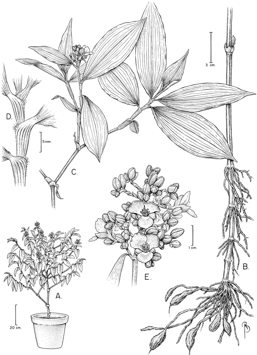
Figure 1. Dichorisandra amabilis J. R. Grant. —A. Habit. (A and E, Grant & Rundell 92-02007 in cultivation.) —B. Stem and underground tuber-bearing roots. (Based on Gómez 20749, NY.) —C. Flowering branch. (C and D based on Atwood & Neill AN140, NY.) —D. Detail of leaf sheaths. —E. Inflorescence; the upper opened flower is bisexual, the lower opened flower is male.