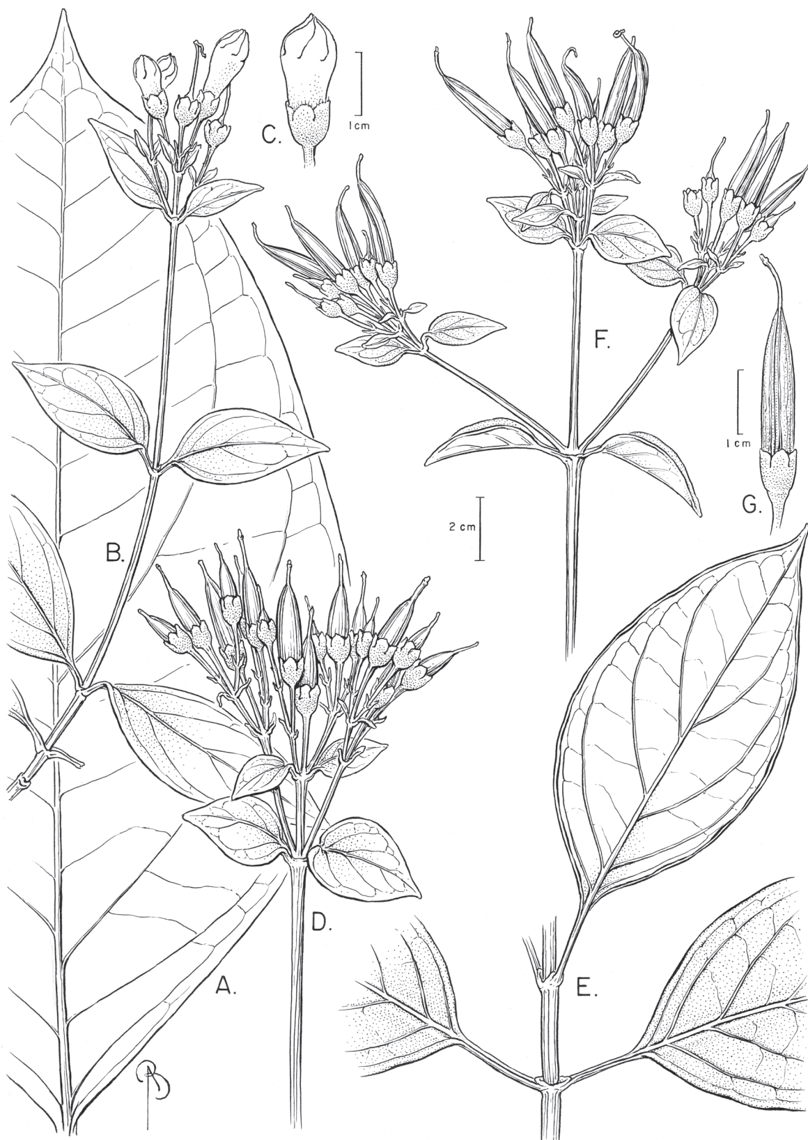
FIGURE 1. Macrocarpaea pacifica (A–D) and M. catherineae (E–G). A, lower leaf; B, flowering stem; C, bud; D, fruiting stem; E, lower leaves; F, fruiting stem; G, capsule. A–D drawn from Grant 4704 (3 unmounted sheets), E–G from Grant 4695 (unmounted specimens).