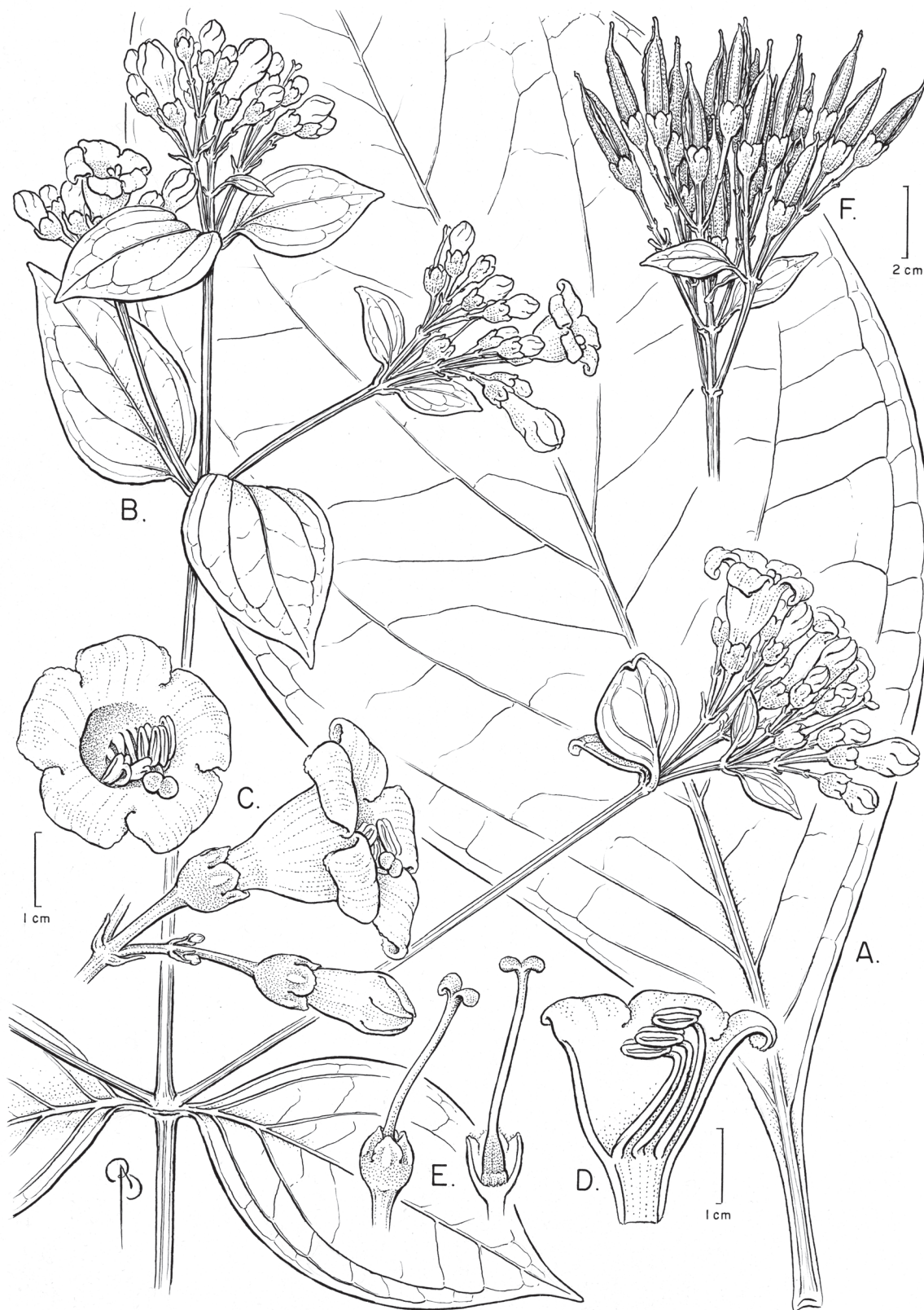
FIGURE 2. Macrocarpaea cortinae . A, lower leaf; B, habit of flowering stem; C, flower, face view, and flower and bud, side view; D, corolla l.s.; E, calyx and pistil, l.s. of same; F, infructescence. All drawn from Grant 5116 (unmounted specimens, pickles and photos).