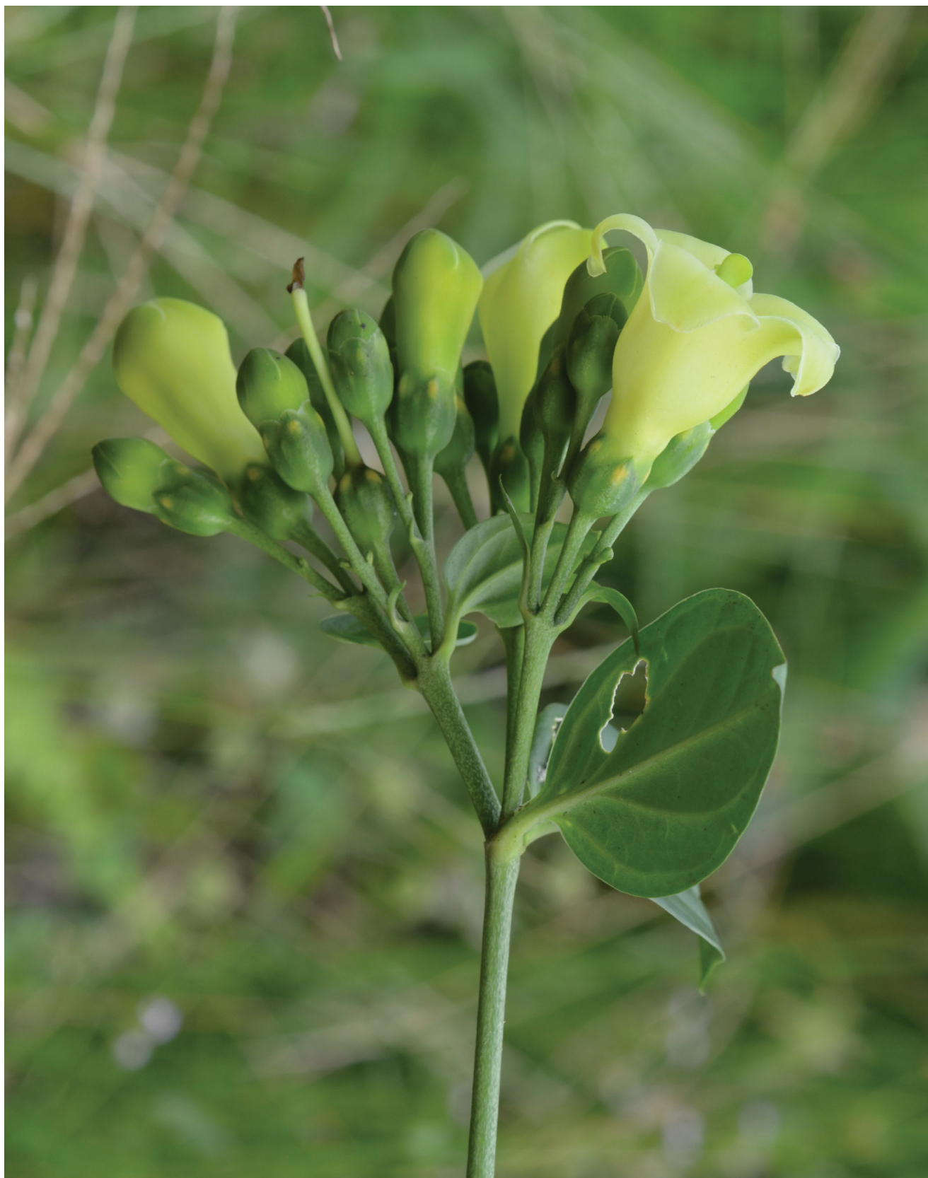
FIGURE 4. Macrocarpaea cortinae . Branch of the inflorescence, notice orange coloration on the dorsal portion of each calyx lobe.