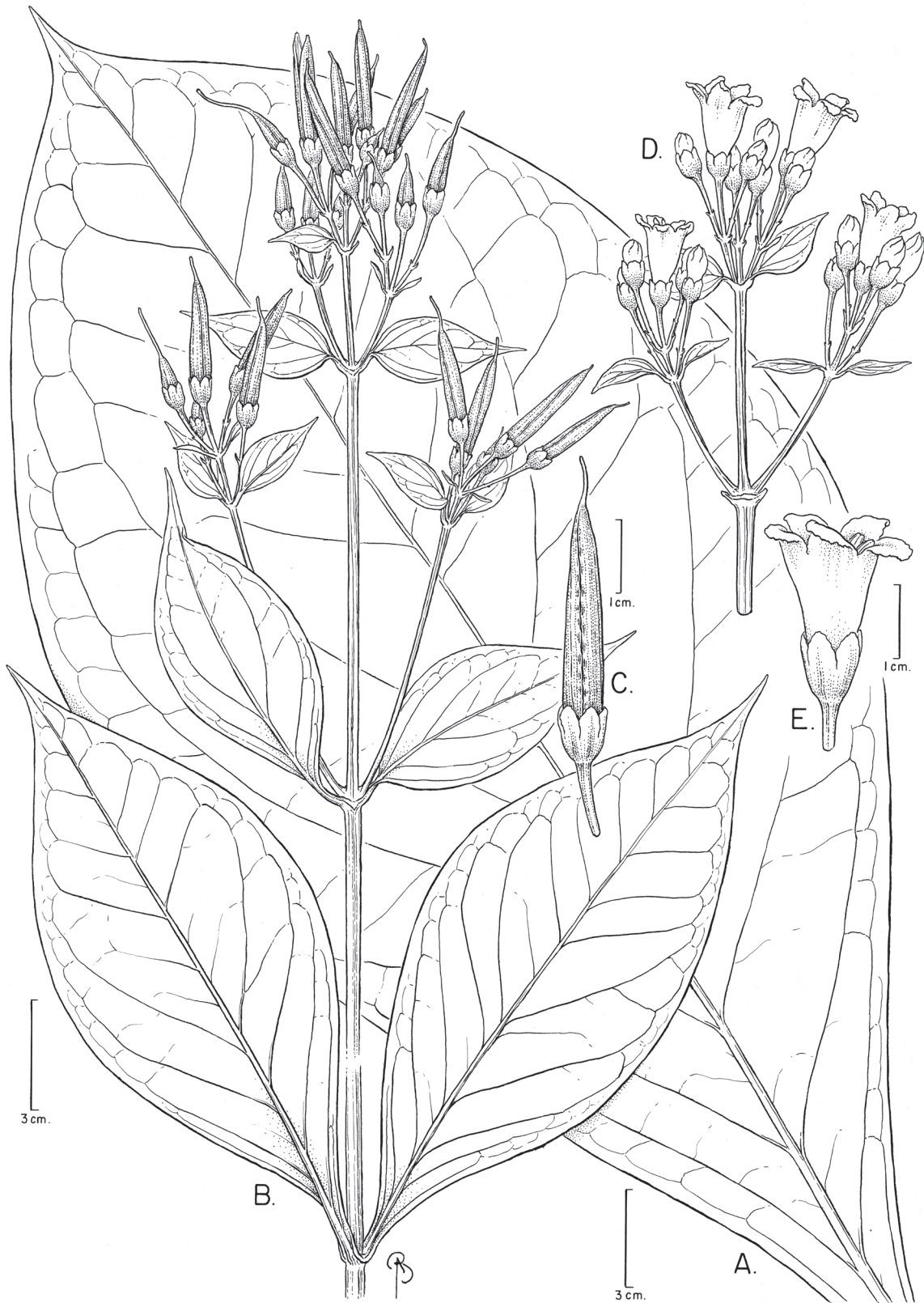
FIGURE 6. Macrocarpaea umbellata . A. leaf; B. habit of fruiting stem; C. fruit; D. flowering stem; E. flower. A–E drawn from Cuatrecasas 14986 (US), B–C from Madison et al. 4795 (F), and D–E from Croat 38605 (MO).