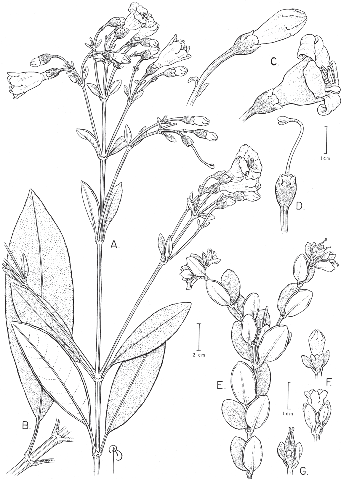
FIGURE 7. Macrocarpaea harlingii (A–D) and M. stenophylla (E–G). A , habit of flowering stem; B , lower leaf; C , flower and bud, side view; D , pistil and calyx; E , habit; F , bud and flower with bracts; G , capsule with bracts. A–D from Grant 4669 (pickles and 2 sheets), E–F from Neill & Quizhpe 16113 (unmounted specimen), G from Neill & Kajekai 16910 (MO).